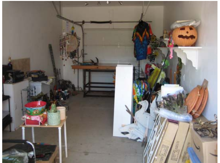
Inside view of Suite B showing the roll up door in the back. Currently being used for storage.