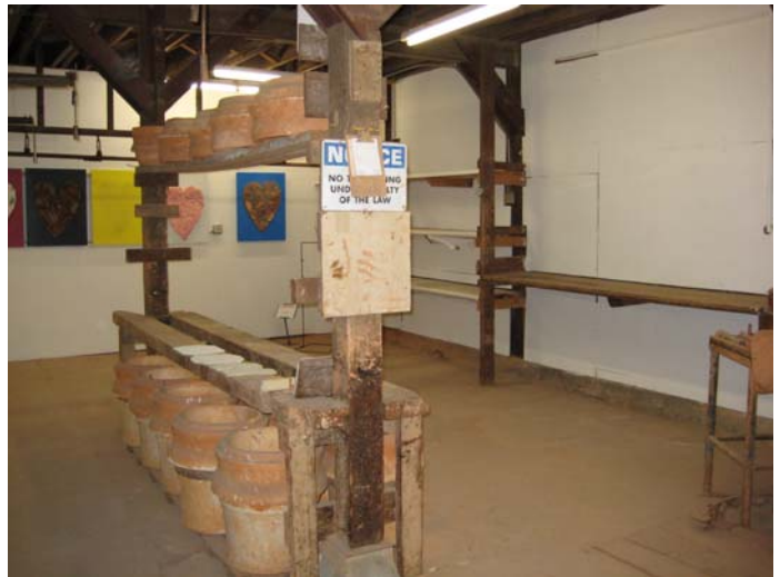
Inside view of workshop showing shelves.