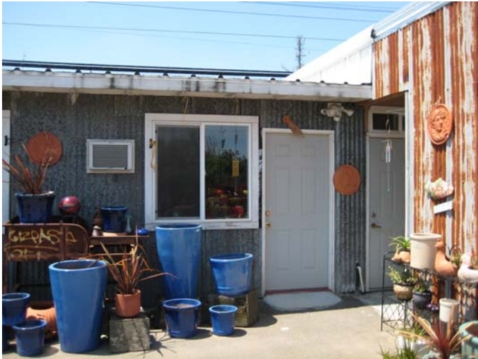
Outside view of Suite B showing front door and window.