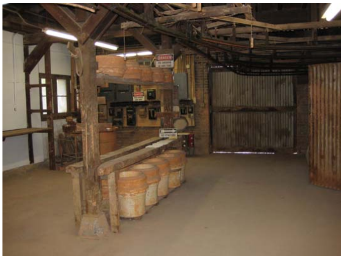
Inside view of workshop showing sliding door. The door opens to 24th St.