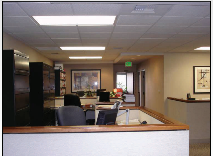
2nd Floor Reception